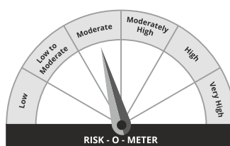
Scheme Risk O Meter

Investors understand that their principal will be at Moderate Risk