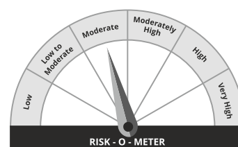
Benchmark Risk O Meter

(It may be noted that risk-o-meter specified above is based on the scheme characteristics. The same shall be updated in accordance with provisions of SEBI circular dated October 5, 2020 on Product labelling in mutual fund schemes on ongoing basis.)